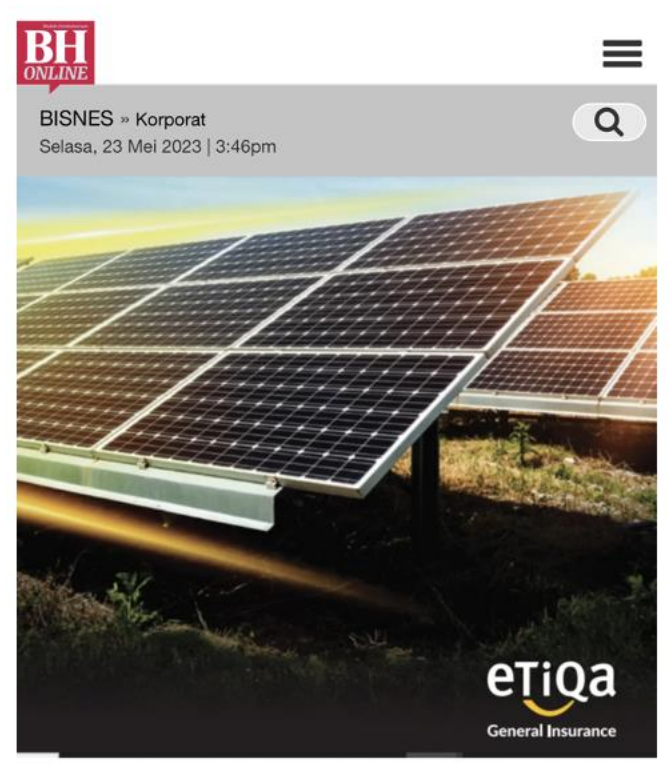
Etiqa General Insurance Bhd